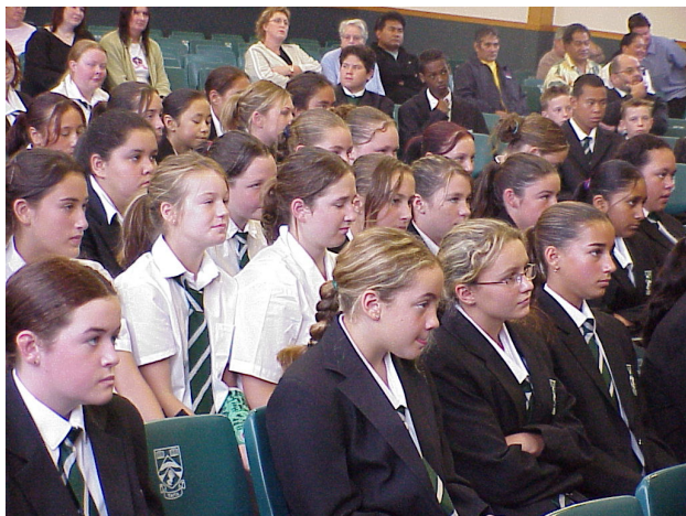
New Yr 9 students listen to the class lists being called out on their first day.

Photographs for student identification cards were taken on Tuesday 14 February. A Taita College ID card will be required by students aged 16 -19 who wish to pay concession fares on buses and trains. They are useful for a variety of other reasons too and now form part of our library distribution system. Students can order ID cards through the student admin office at a cost of $8.50 per card.