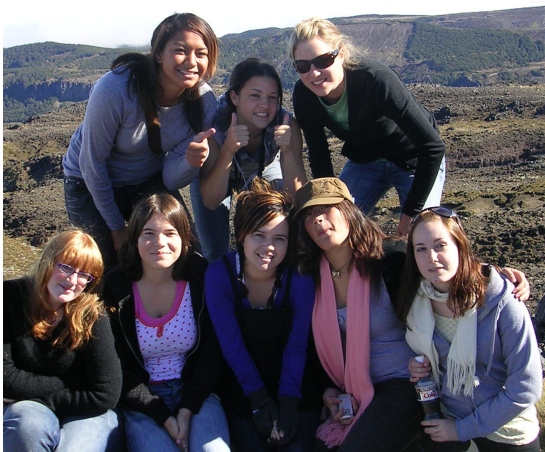
Getting up close and

Geographers and historians all spent time amidst the volcanic landscape of the North Island Central Plateau this term. They were variously investigating the natural features of a volcanic area, looking at the conflicting and complementary land uses of the area, researching the Tangiwai rail disaster, visiting the Rotorua and Waiouru museums, inspecting the Te Porere battle site and a host of other activities that make this a rich area of research.