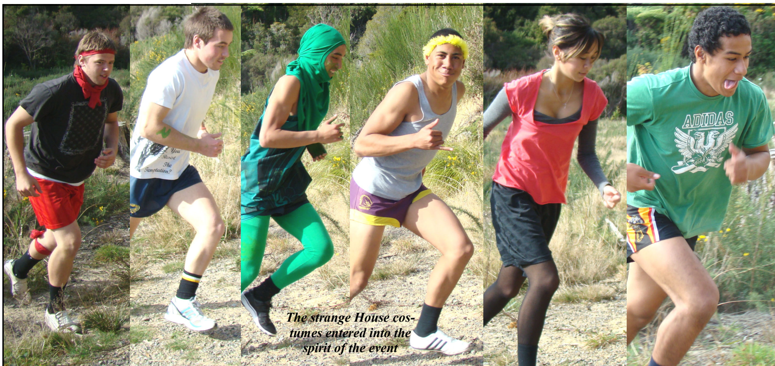
The strange House costumes entered into the spirit of the event

With the win Bear House also went to the top of the House ladder with 3,480 points, a mere 12 points ahead of previous leader Narraway on 3,468, and less than 200 ahead of Athletics Day winning House, Jamieson on 3,293pts. Charles House is in 4 th place on 2446, but with the sporting events of the competition over and the Spelling Bee and House Performing Arts Challenges yet to come, it may be Charles House's true strengths have yet to be showcased. We won't have to wait long to find out with the House Spelling Bee challenge. May the best House win!