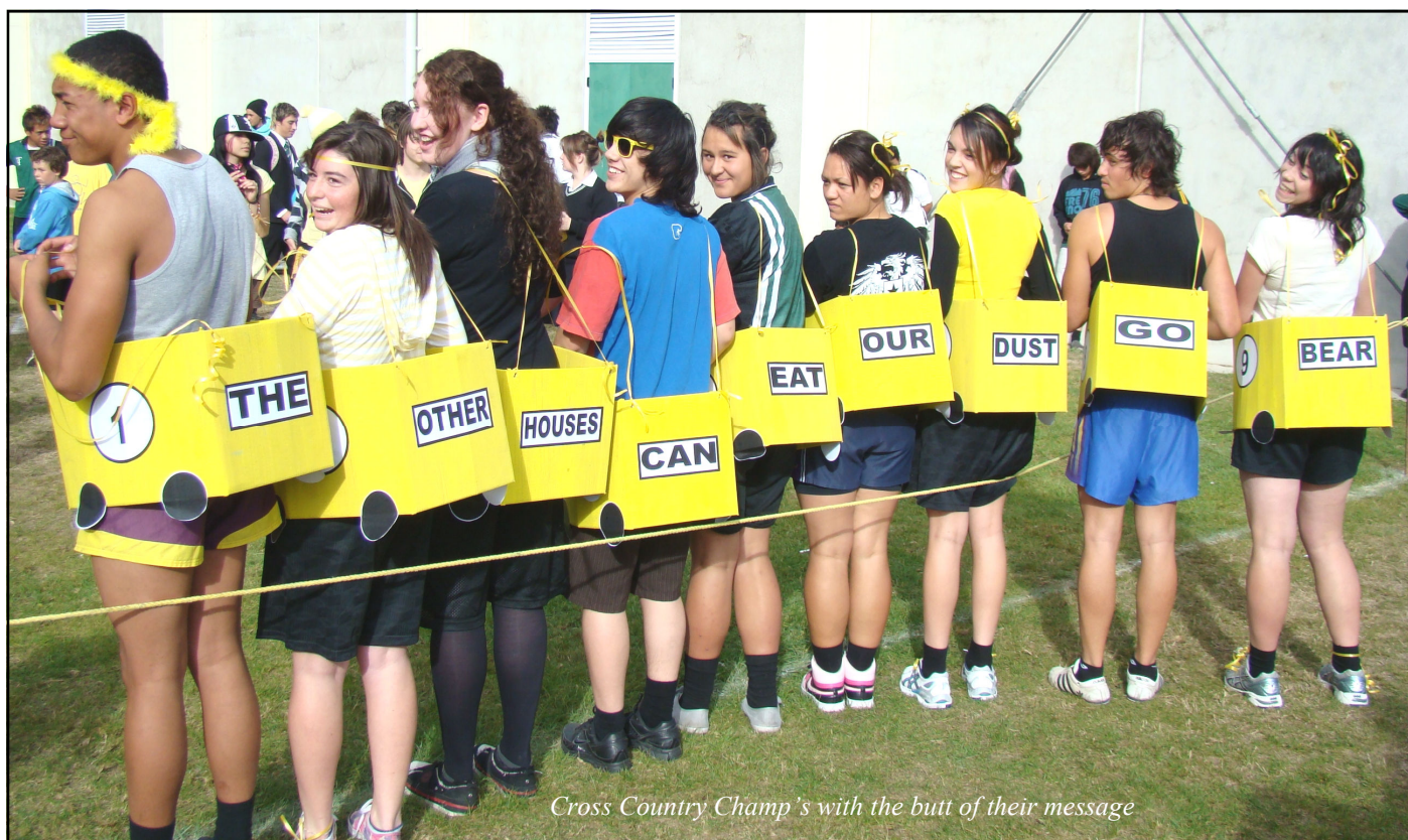
Cross Country Champ's with the butt of their message