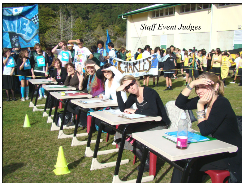
Staff Event Judges

Despite a threatening forecast for the afternoon, the PE staff predicted the sun would shine on the 2010 event. Once again the PE staff bettered the meteorologists, with students and staff gathering under warm May sunshine on the field by the BRC, awaiting the start of proceedings.